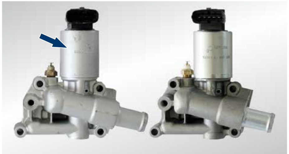
Image 1: A painted EGR valve (arrow) looks like new – but it is not.

In general, components of an older model series are reconditioned; i.e. technical innovations have not been implemented in this product.